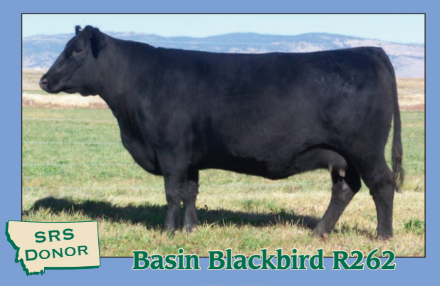
Balancing Traits for over 37 years!